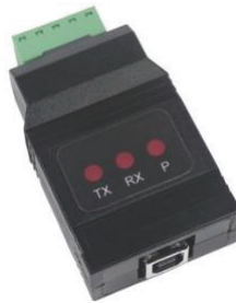
ACC1003 USB RS-485 Isolated Converter