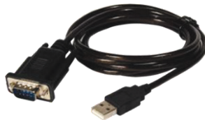
ACC1002 USB to RS-232 Converter