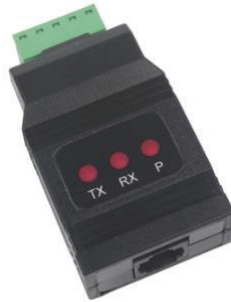
APMA7422 RS-485 Serial Adapter