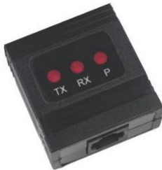
ACC1000 USB Serial Adapter