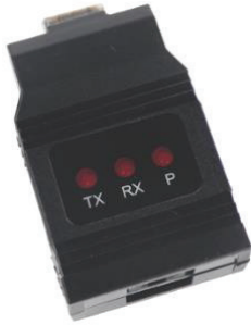
APMA7232 RS-232 Serial Adapter