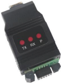
ACC1001 RS-232 to RS-485 Isolated Converter