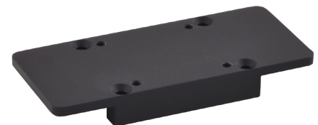
AP-CC-01 Conduction-Cool Kit